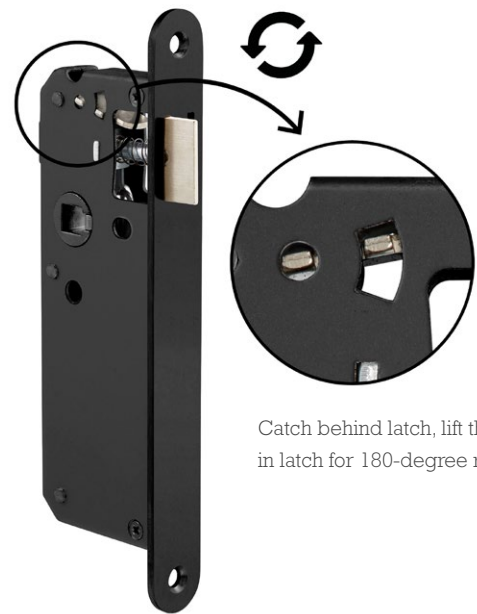
Catch behind latch, lift then push in latch for 180-degree rotation