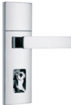
8901 ANG BC