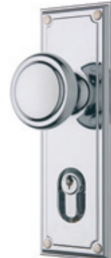
890 TRI BC