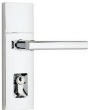
8901 ALI BC