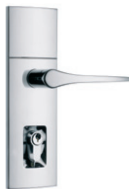
8901 PRE BC