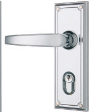
890 TLE BC