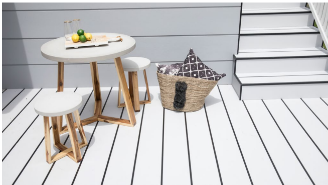
Berger 2 – Shale Grey