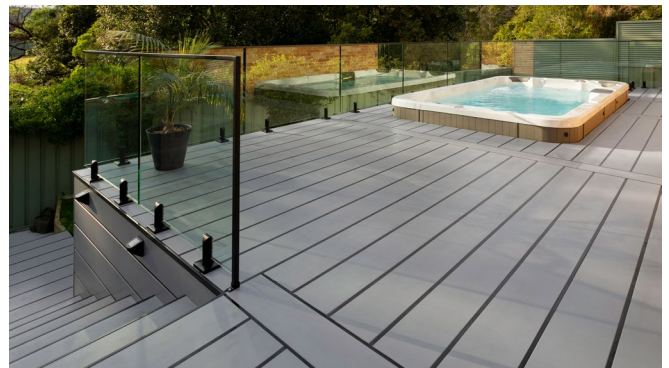
Crommelin® DiamondCoat® – Mid Grey

Solid colours provide a sleek, contemporary look on HardieDeck™. The recommended sealing systems can be tinted in a range of colours to provide you with the perfect finish that suits your home.