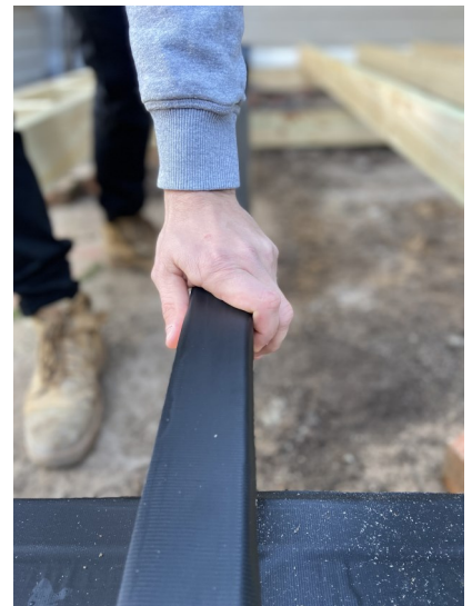
6. Once applied go over the taped area with firm pressure to