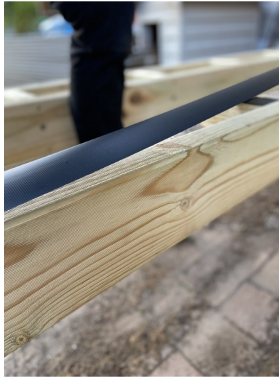
5. Do not stretch VapourSeal during installation ensuring slack is available.