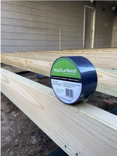
1. Use appropriate VapourSeal widths for the frame e.g. 50mm