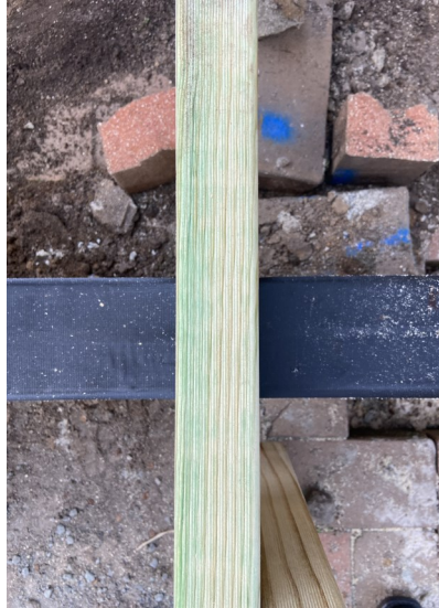
2. Ensure timber frame is dry and has been kilned to standard.