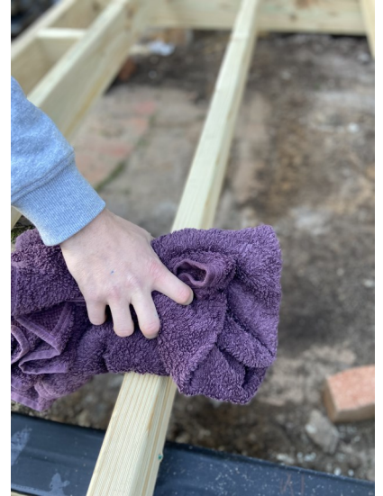
3. Make sure timber frame is free of any dirt, saw dust and