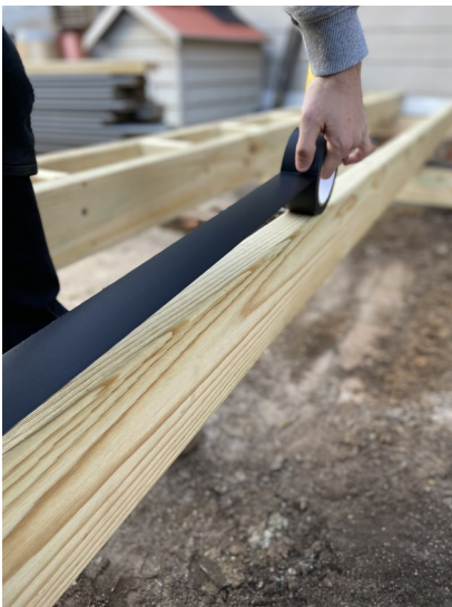
4. Apply VapourSeal onto the frame in a straight line and ensure